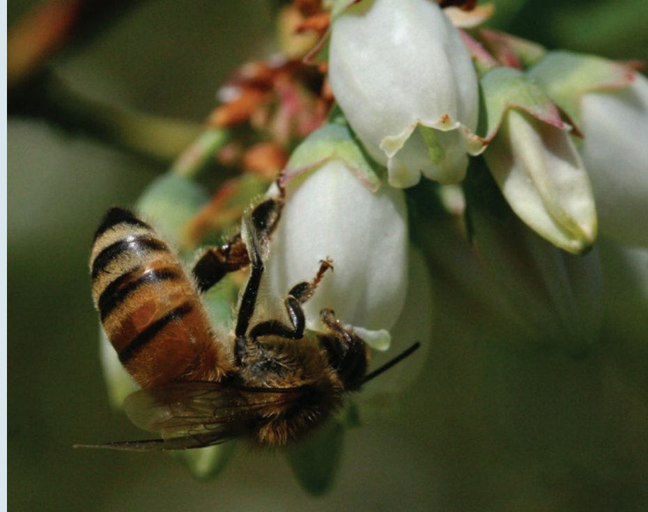
Honey bee nectaring on highbush blueberry. Spring-flowering trees and shrubs are important food resources for many pollinators.