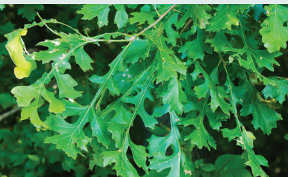
Elongated leaves in Burr oak.

Dicamba damage — recognizing it. If you suspect your trees may have herbicide damage, first become familiar with the most common leaf symptoms: cupping, curling, twisting, elongation, or stunted, smaller leaves. You may also see some branch dieback. There are many places where you can find photographs of trees and plants that have received herbicide damage, such as university extension plant health guides and reputable tree and plant health resources on the internet.