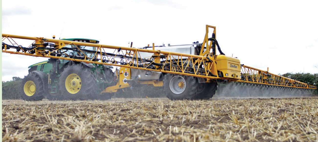
Dicamba is commonly applied early in the season to control emerging weeds.

While early season burndown use of dicamba herbicides has always posed some concerns, the level of drift injury has spiked since the introduction of new in-crop formulations used later in the season, when temperatures are higher.