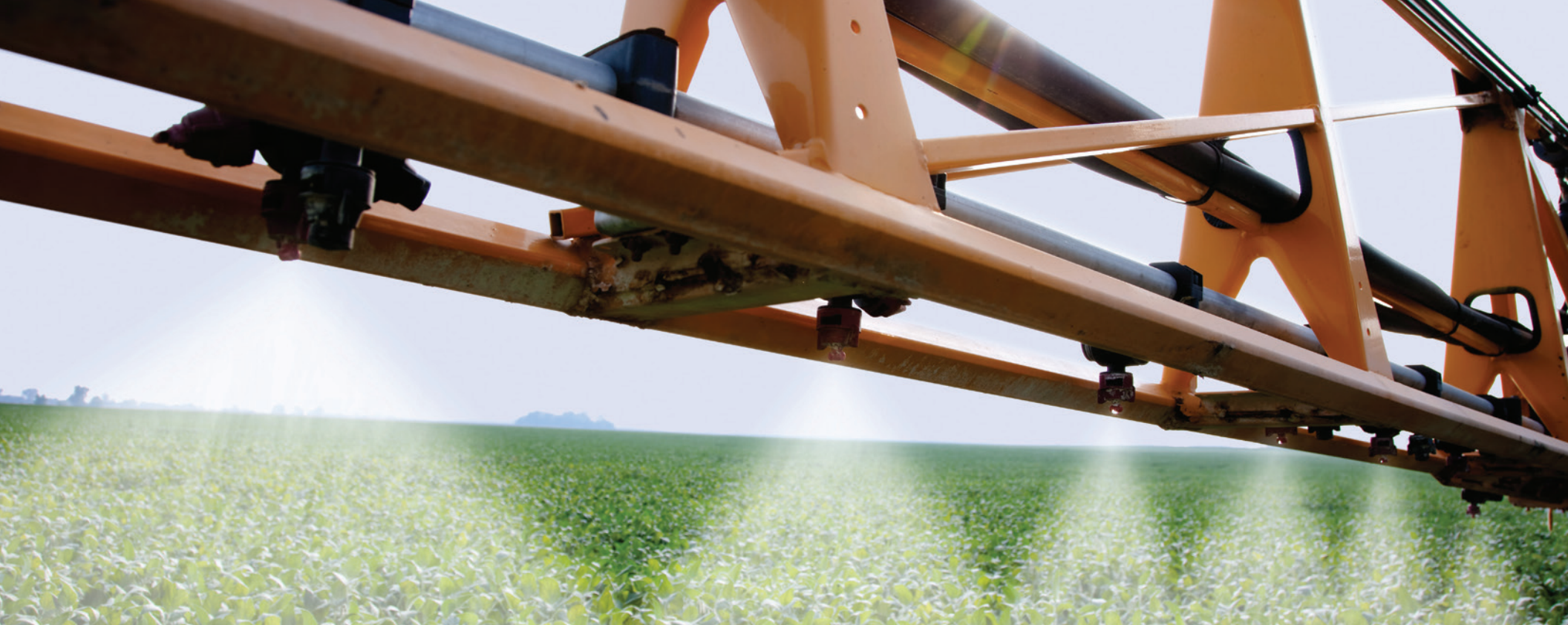
Soybean spray.