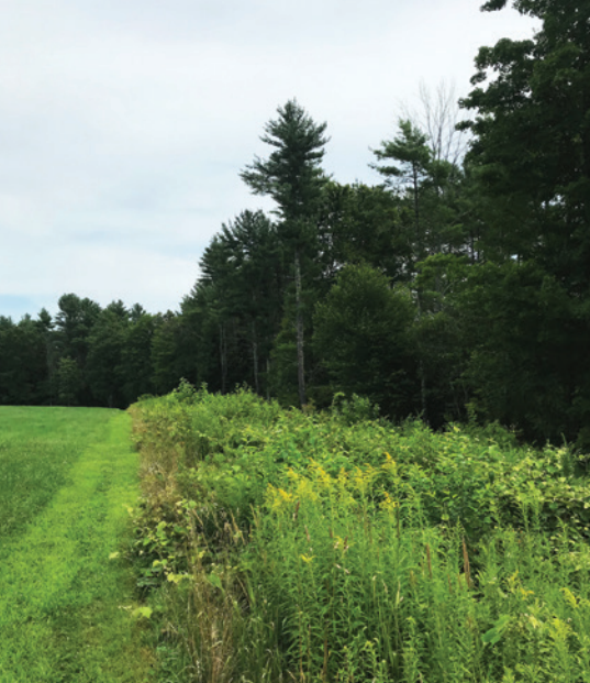
Field edges can be important wildlife habitat.

Ecological weed management practices include choosing crop varieties that are competitive with weeds, adjusting planting dates and depths of crops to help get ahead of weed growth, and managing nutrients in ways that give crops the competitive edge.