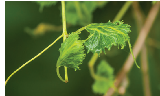
Wild grape stunted, with irregular margins.