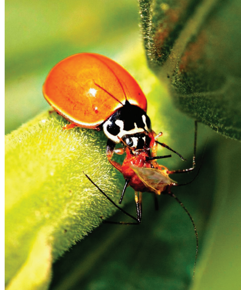
Lady beetles, which are important beneficial insects for controlling soft-bodied insects like aphids, are threatened directly and indirectly by dicamba herbicides. Here, a polished lady beetle feeds on an aphid.

However, the largest risk of dicamba use to bees and other beneficial insects that rely on pollen and nectar for food is likely to be loss of food sources and declines in forage quality. The quantity, quality, and diversity of floral resources can affect bee development, physiology, and immune response, with many potential impacts on individual bee and colony longevity and reproductive capacity. 46-48 The increased use of these herbicides during the middle of the growing season for in-crop weed management threatens a wide array of flowering broadleaf plants that provide food and shelter for bees and other beneficial insects. Glyphosate use on glyphosate resistant crops led to an estimated 58% decline in milkweeds in the Midwest, and an associated decline in breeding monarchs between 1999-2010. 49 Dicamba has a greater potential to reduce flowering plant survival in areas farther from agricultural fields than glyphosate due to its greater volatility.