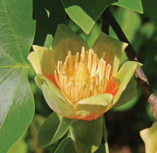
Tulip poplars are important spring resources for bees, but buds, leaves, and flowers can be heavily impacted by dicamba injury.

The lack of information about the impacts of this widespread use, combined with the reduction in many state and federal monitoring programs, makes it difficult to gauge the impacts of pesticide use in ecosystems that already face many stressors.