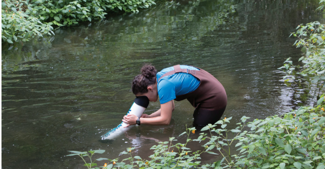
Like many other pesticides, dicamba is water soluble and can easily move into and contaminate aquatic ecosystems, posing risks to aquatic life. Here, the lead Freshwater Mussel Biologist for the Xerces Society surveys a stream for freshwater mussels, which are highly susceptible to environmental contaminants.

Many pesticides, including the herbicides dicamba and 2,4-D, are water soluble and can readily enter surface water bodies, where they may also pose risks to aquatic life.