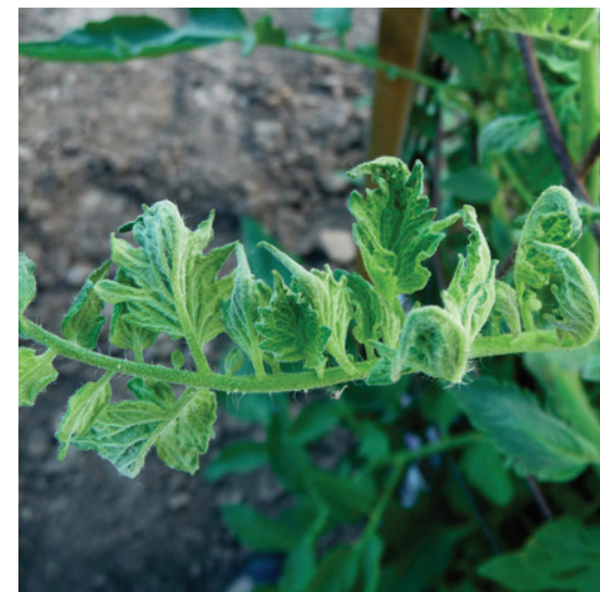
Tomato plant with symptoms of herbicide injury.

While the new over-the-top formulations in soybean and cotton appear to be the main source of dicamba-related pesticide injury reports over the past few years, other dicamba formulations used for post-emergent weed control in corn also pose concerns. According to a survey of Nebraska farmers in 2017, about 30% of dicamba injury observed on non-dicamba resistant soybean may have been attributable to use in corn. 20 Mid-season applications of dicamba products in corn have increased in recent years to control glyphosate-resistant weeds. 26 Weed scientists from Iowa State University echoed this and reported an increase of dicamba use in corn both in acreage and rate of application. 12 Label guidance and Extension recommendations around the use of these products is highly variable and often does not adequately reflect concerns with drift and volatility.