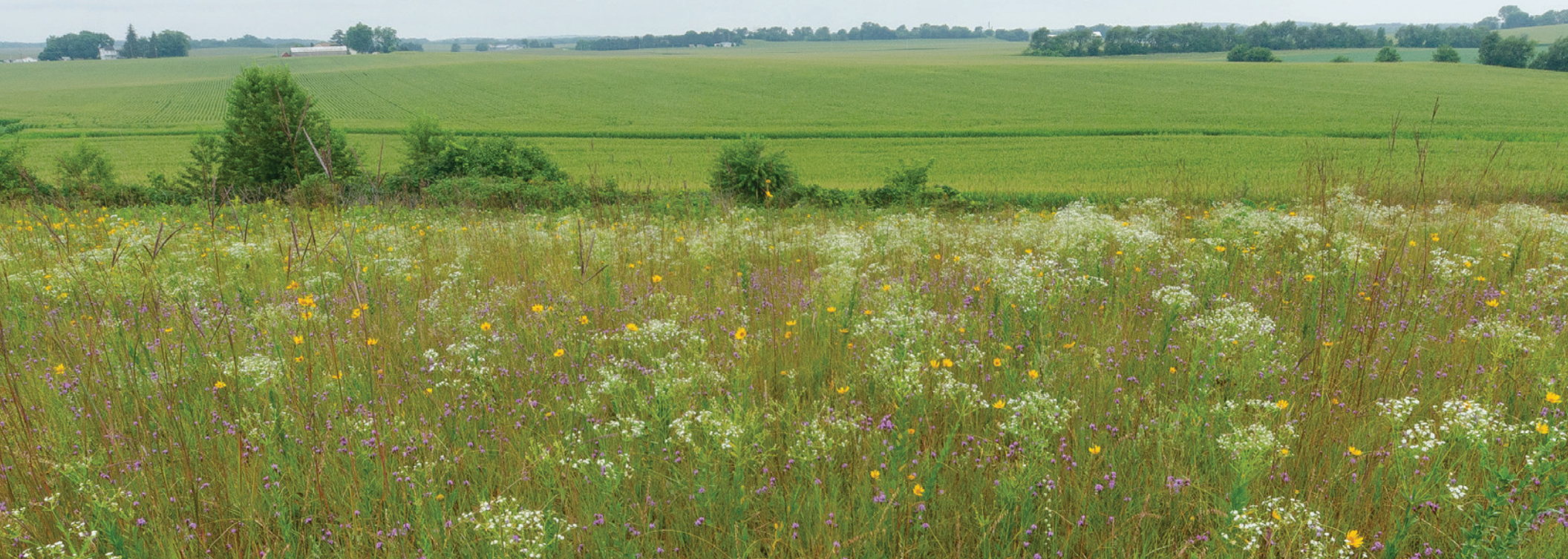
Smith-Reiner Drumlin Prairie in Wisconsin.