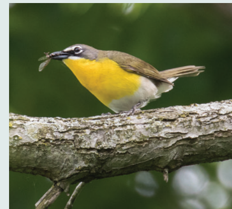
Yellow-breasted chat with insect.

Document symptoms in addition to reporting. While it is important to report symptoms to your local agency that regulates pesticide use, it is just as important for you, the landowner to document suspected injuries. First be sure the injury is not something you caused yourself! Many lawn care products contain herbicides that kill broadleaf plants and these chemicals can move through the soil or volatilize and injure your trees and plants. If herbicide injury has occurred to your property, symptoms will likely be present on more than one plant type or species in the area. It is good practice to examine trees, vines, shrubs, and/or several types of herbaceous plants in the area for symptoms, this can help rule out other causes of injury. When you notice symptoms, document them immediately, noting the date, plant name, location, and any important notes. Also include several photographs. It is best to get a couple close-up photos of symptomatic leaves as well as one or two of the whole plant or tree. Be sure to also take note of the symptoms you observe such as leaf cupping, stunting, elongation, twisting, or branch dieback, etc.