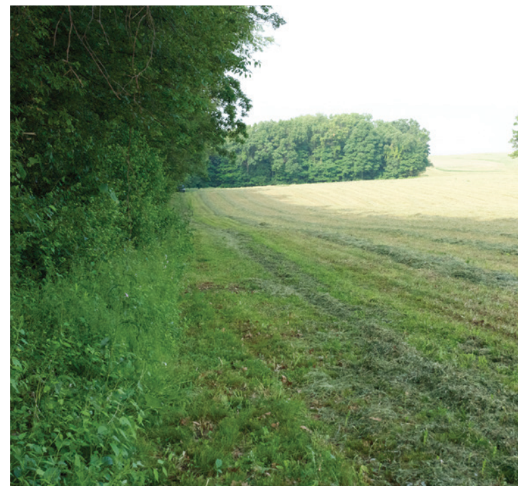
Damage from volatile herbicides does not stop at the field edge. Dicamba drift places wild plant communities and the wildlife that depend on them at risk.

need for further research on impacts to various species from dicamba. While concerns around drift apply to other phenoxy herbicides such as 2,4-D—which has also seen increasing use and associated off-site injury complaints in the past year—this report is focusing on dicamba, given the upcoming registration decisions for over-the-top dicamba products in 2020. This report highlights the threats to non-target crops, wild plants, and other wildlife from the use of dicamba herbicides, and provides a few short-term and long-term recommendations for reducing environmental harm from these volatile herbicides.