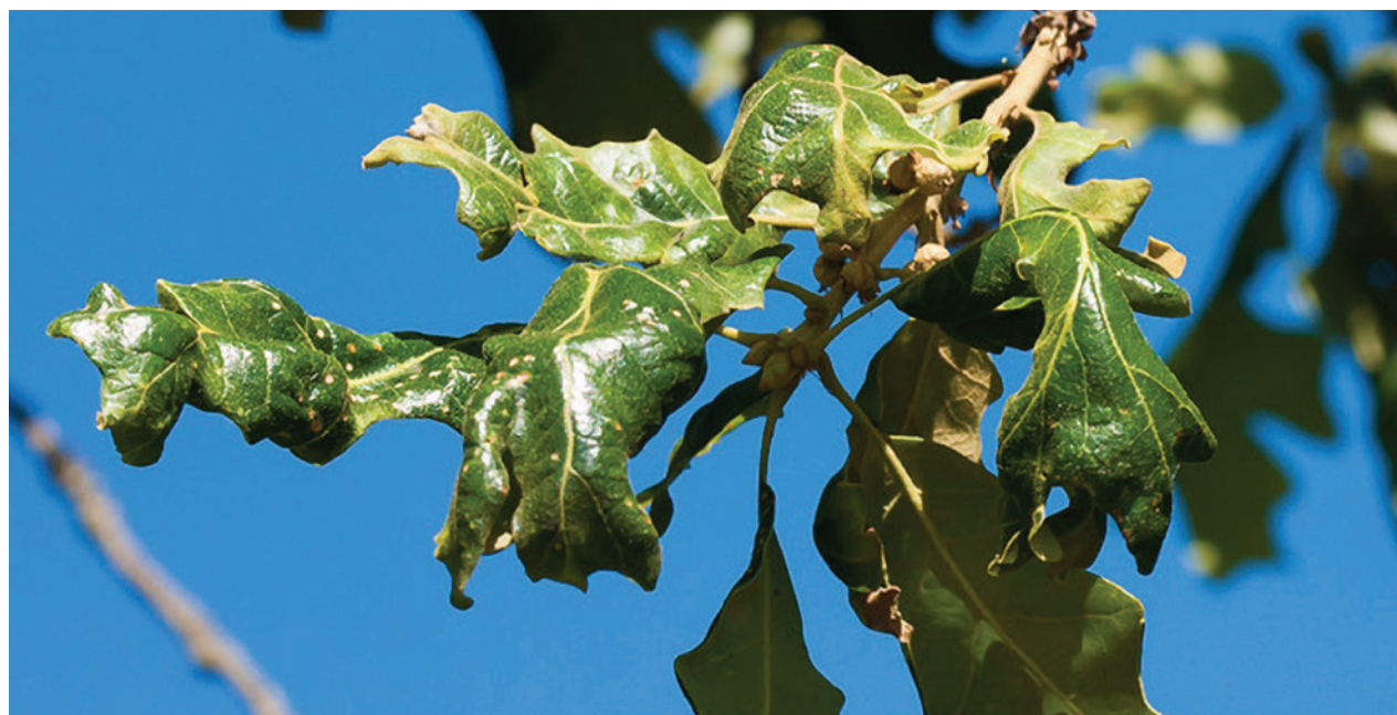
Post oak with deformed and stunted leaves.

site, they pose threats to wild plants and the wildlife that depend upon them. Loss of native plants and declines in forage quality poses risks to bees and other beneficial insects that rely on pollen and nectar for food. These risks ripple through numerous food webs, including those of birds, which rely on a wide variety of plants and invertebrates for food resources. This report will discuss what’s known about the wider ecological impacts of dicamba and related herbicides to native plant communities and the wildlife they support, and provide a few short-term and long-term recommendations for reducing environmental harm from these volatile herbicides.