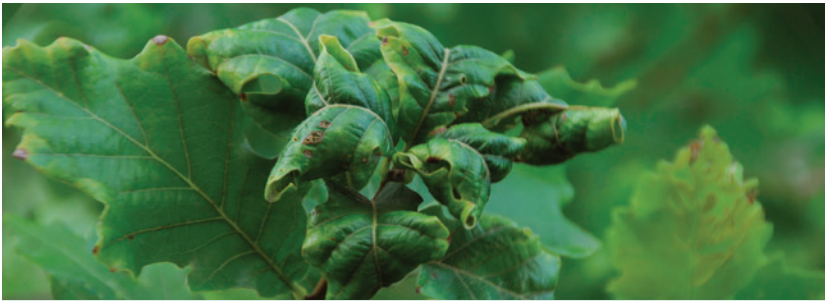
Young white oak tree showing symptoms of potential growth regulator herbicide injury.

News stories about the destruction dicamba has wrought in the last few years have mostly featured farmers suing other farmers or neighbors getting into arguments about damage to their commercial row crops, including non-resistant soybeans. For this report on impacts to other plants and wildlife, we spoke with a few people who are experiencing damage to their property and livelihoods, including their organic farms, forests, and apiaries.