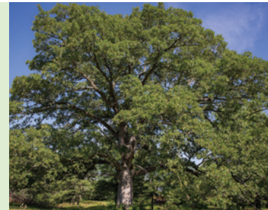
IL state record post oak