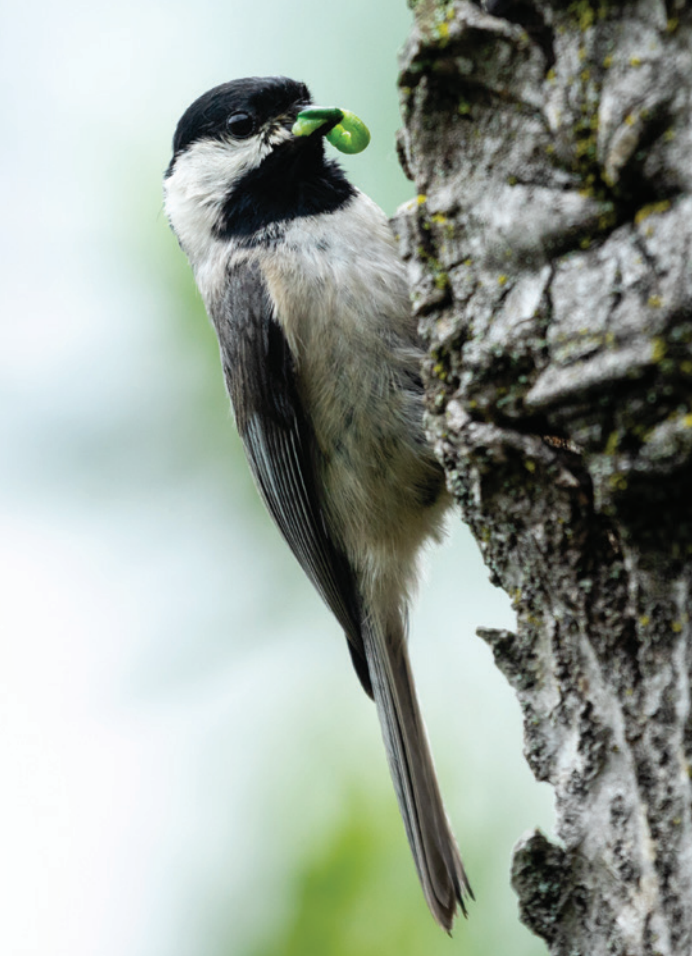
Carolina chickadee brings a caterpillar to its nest.

bird species feed their young on insects, and caterpillars are one of the main sources of protein for young birds. 59-63 Native trees host thousands of species of larval moths and butterflies; oaks, willows, birch, poplar, and cottonwoods each support more than 300 species of moths and butterflies. 64 Research has shown that even subtle changes in insect prey availability in agricultural landscapes caused by pesticides can have harmful