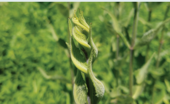
Rosinweed twisting.