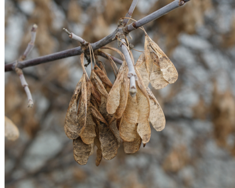
Box elder maples provide important food resources for birds but are sensitive to dicamba.

Dicamba could also impact birds through its effect on bird habitat. The use of herbicides in farming has dramatically altered habitat patterns in North America, and strong evidence exists for adverse effects of changes in habitat pattern on birds. 66 Based on a thorough literature review and analysis, there is a strong argument to be made that the decline of ducks nesting in the prairie pothole region of North America was likely related, at least in part, to adverse alteration of food, nesting, and protective cover in uplands, pothole, and pothole margins from repeated, broad scale use of herbicides. 67 Non-game species dependent on weeds and their seeds are especially vulnerable to more intensive and extensive use of herbicides because of the loss of weedy foraging and nesting sites in fields and adjacent habitats such as hedgerows. 58 In addition to reduced availability of food for chicks, gray partridge declines have also been linked to loss of suitable nesting cover from removal of field margin habitats, particularly hedgerows. 57