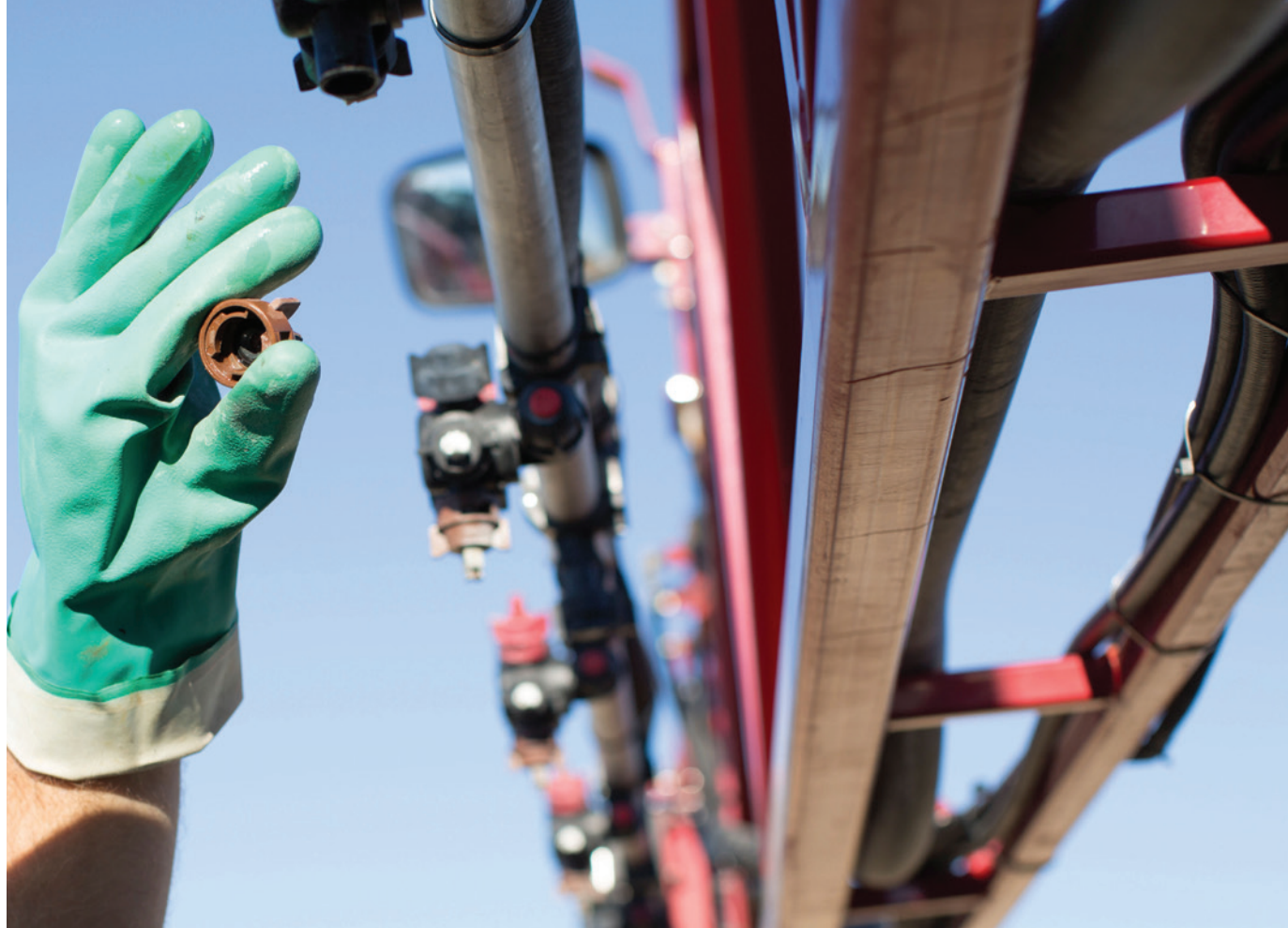
Farm workers, pesticide applicators, and their families are the most likely among the general population to have repeated exposures to agricultural pesticides, including dicamba.

While it is not the main focus of this report, it should be noted that little is known about the environmental impacts of widespread use of dicamba on human health. There is very little published information on the environmental loadings from the recent increased use of this herbicide. Among the general population, farmers, farm workers, pesticide applicators, and their families are the most likely to have repeated exposure to agricultural pesticides, including dicamba. 83-85 Communities living near agricultural lands also experience higher exposure to pesticides than the general population. 86