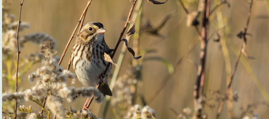
Savannah sparrows will feed on seeds from field margin plants like goldenrods.

be given the adequate financial resources required to improve the reporting process, as well as to investigate incidences and properly enforce their pesticide laws.