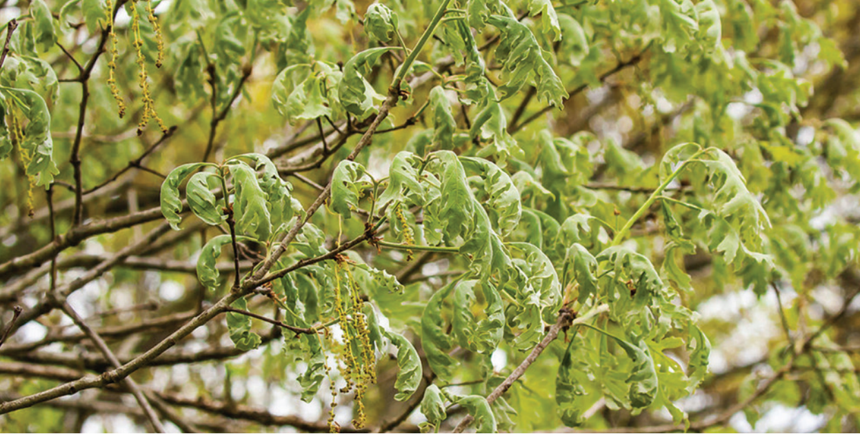
White oak with symptoms of growth regulator herbicide injury.