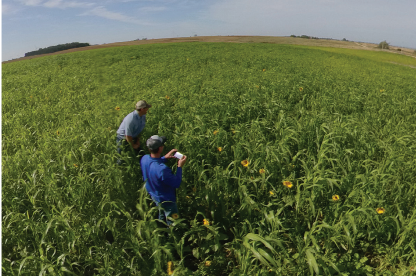
Greater investment is needed in research and technical support for integrated weed management systems.

This report has outlined what little is known of the impacts of dicamba and similar plant growth regulator herbicides to herbaceous and woody plants and the wildlife that depend on them. It also summarizes the many unknown off-target impacts of these herbicides that need to be addressed in future research. While current dicamba injury claims, rulings, and settlements almost exclusively address crop damage, harm to wildlife and habitat