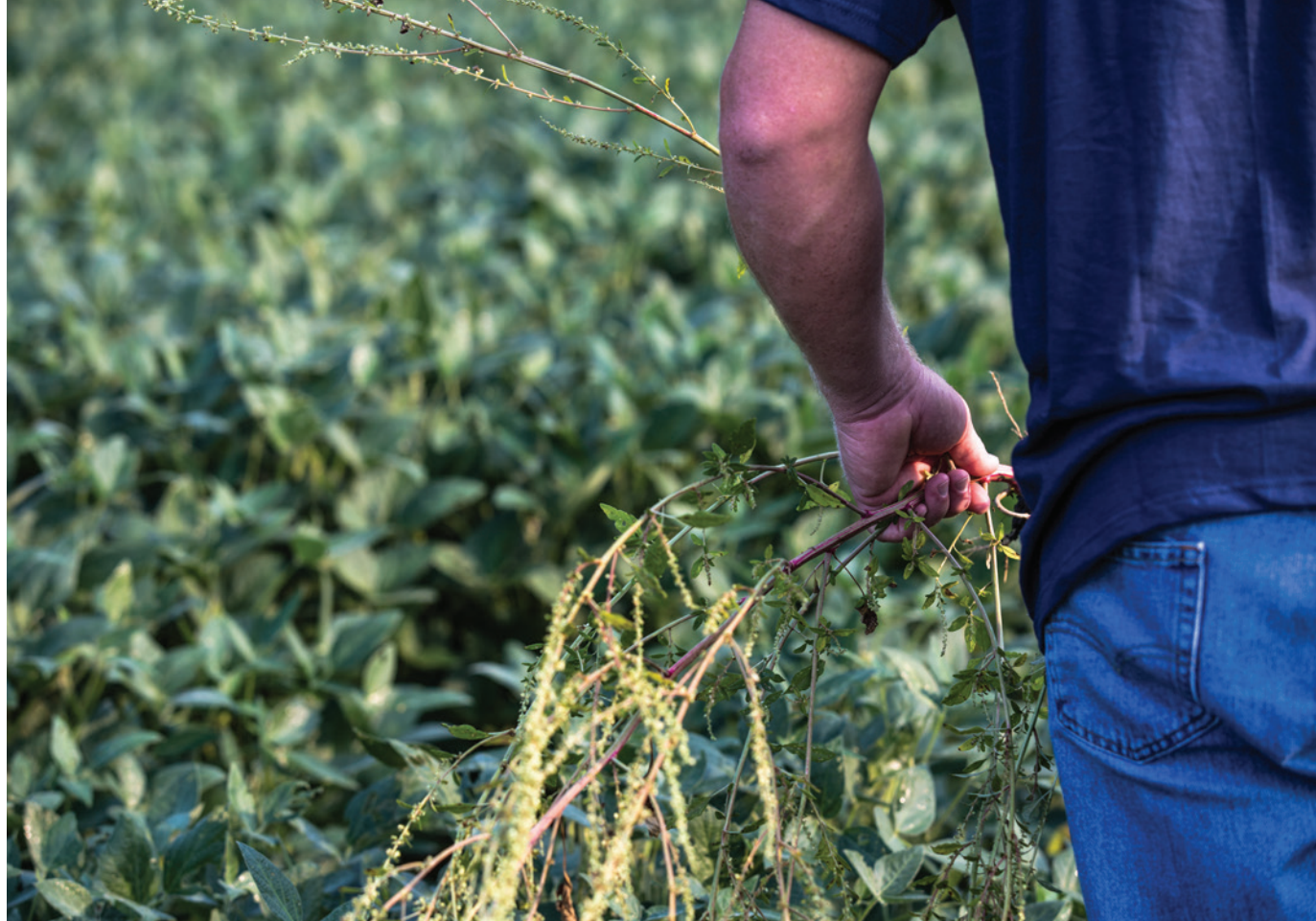
Palmer amaranth, a highly competitive annual weed in row crops like soybean.

Dicamba was first introduced in the 1960s and has been widely used for broadleaf weed control in crops, lawns, and turfgrass. Dicamba and the similar herbicide 2,4-D are synthetic auxins, or growth regulator herbicides that mimic plant hormones and disrupt growth in broadleaf plants, including many weeds. In crops, these pre- and post-emergent herbicides have historically been used at the beginning of the growing season to “burn down” annual broadleaf weeds to prepare crop fields for planting.