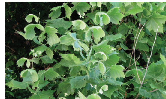
Sycamore curling and cupping.