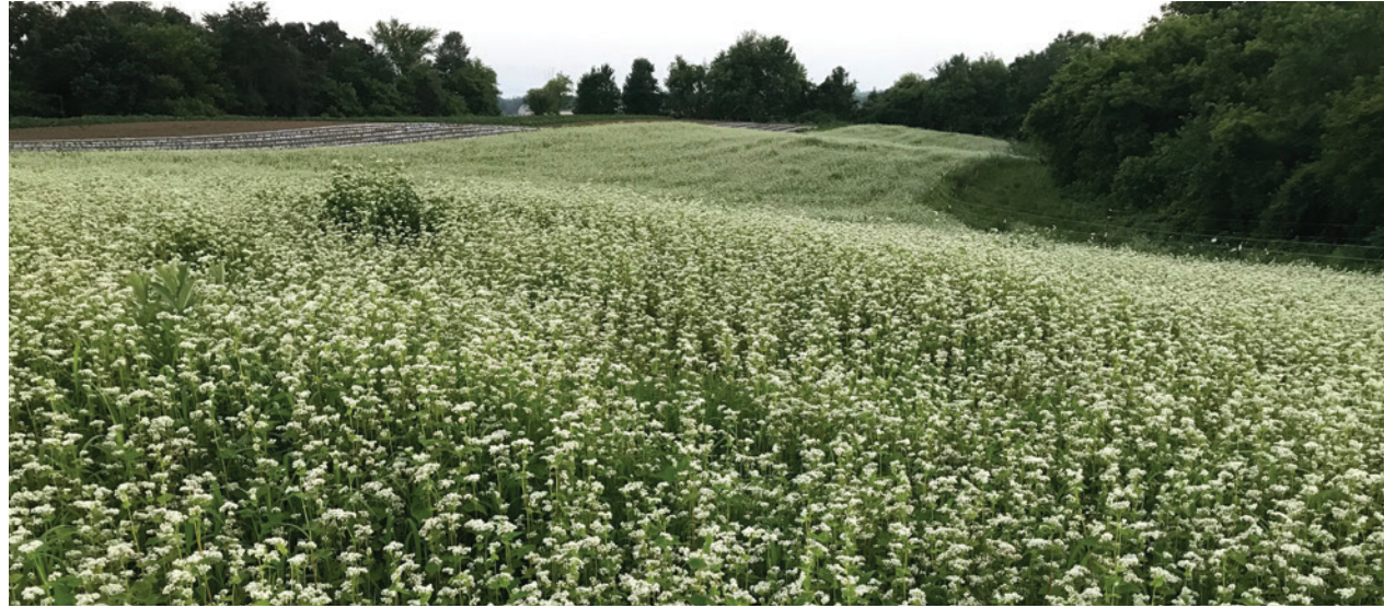
Buckwheat can help improve soil health, suppress weeds, and provide resources for pollinators.

Herbicide-resistant weeds can spread quickly—moving from a single introduction to over 20% of a field area within 2 years—when managed only with the herbicides to which they’ve developed resistance. Palmer amaranth and waterhemp are prolific seed producers and have a zero tolerance threshold, as individual plants can deposit thousands of seeds into the seed bank. 90 Surveys estimates