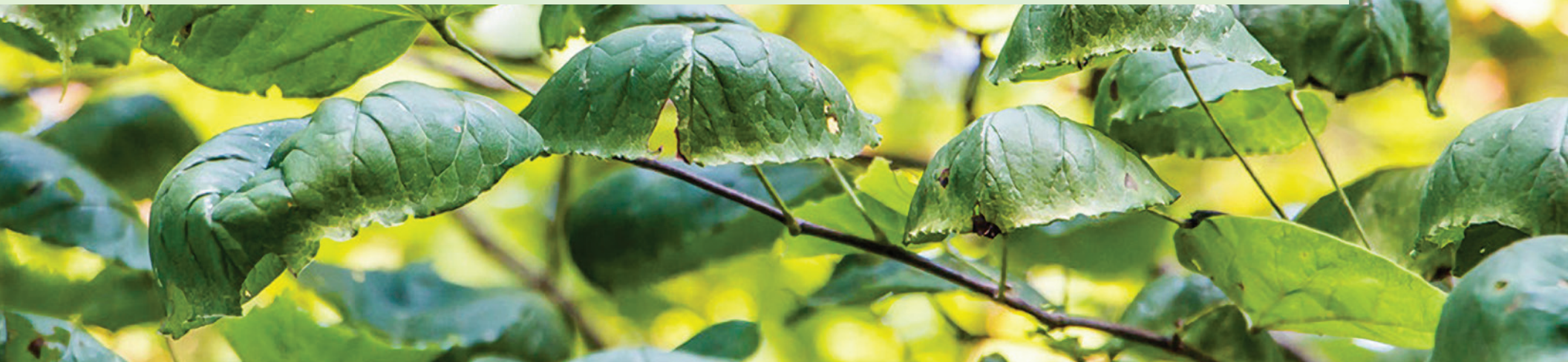
Redbud with irregular margins and cupping.

The impacts of the herbicide dicamba to wild plant communities and wildlife habitat in agricultural landscapes