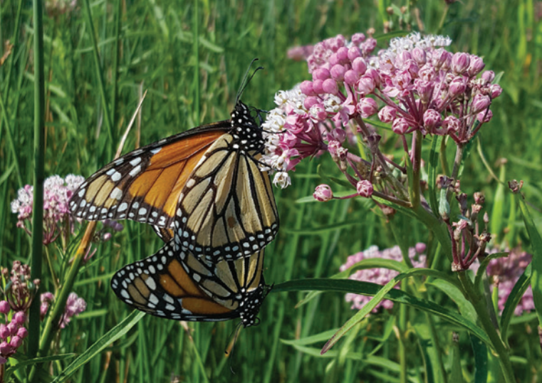
Monarch butterflies on swamp milkweed.

require more energy and increase the risk of mortality from predators, weather events, and pesticide exposure.