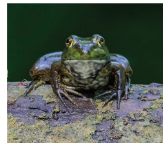
Amphibians can be highly susceptible to environmental contaminants.

Amphibians are of unique interest in regards to environmental pesticide exposures due to their complex lifestyle and metamorphoses. They inhabit the water and land, and undergo dramatic physiological changes throughout their lifecycle. They also have permeable skin, which can allow for rapid exposure and uptake of environmental contaminants. 78,79 Research