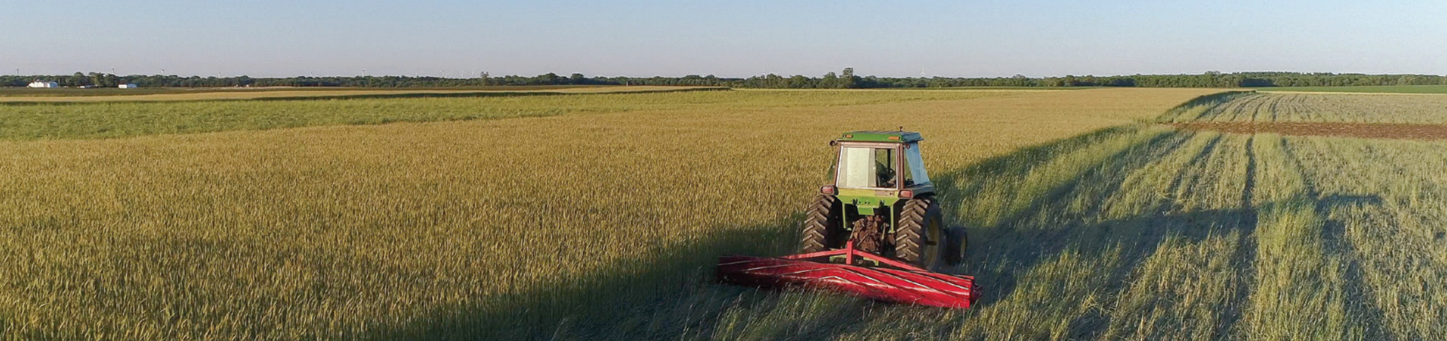
Roller crimping rye.

If using chemical methods of weed control, farmers should practice careful herbicide resistance management by rotating different herbicide modes of action and not continually applying herbicides in the same grouping. 120 Spot spraying and hand weeding in fields and field margins can also be important in a zero tolerance approach. Farmers can also burn collected piles of weeds that have already produced seedheads. However, even with careful resistance management, cross-resistance to multiple herbicides can sometimes develop.