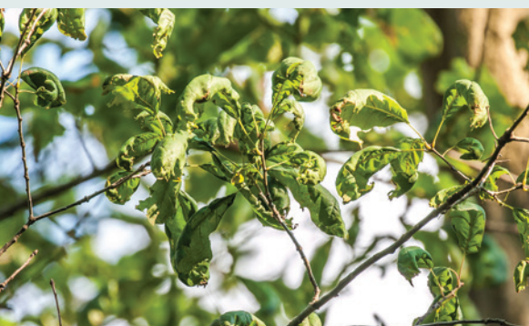
Curling, stunted and deformed leaves.