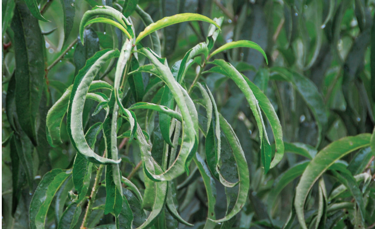
Many fruit and vegetable crops, like this peach tree are very sensitive to plant growth regulator herbicide drift.

The widespread reports of dicamba volatilization and injury to fruits and vegetables over the past few years prompted the U.S. Department of Agriculture's Fruit and Vegetable Industry Advisory Committee, which represents the retail and commercial produce industry, to "strongly recommend the registration for XtendiMax, Engenia, FeXapan and Tavium or any other new formulations for in-crop use in soybeans and cotton not be renewed when the current registration expires" in its set of recommendations released in spring 2020. 25