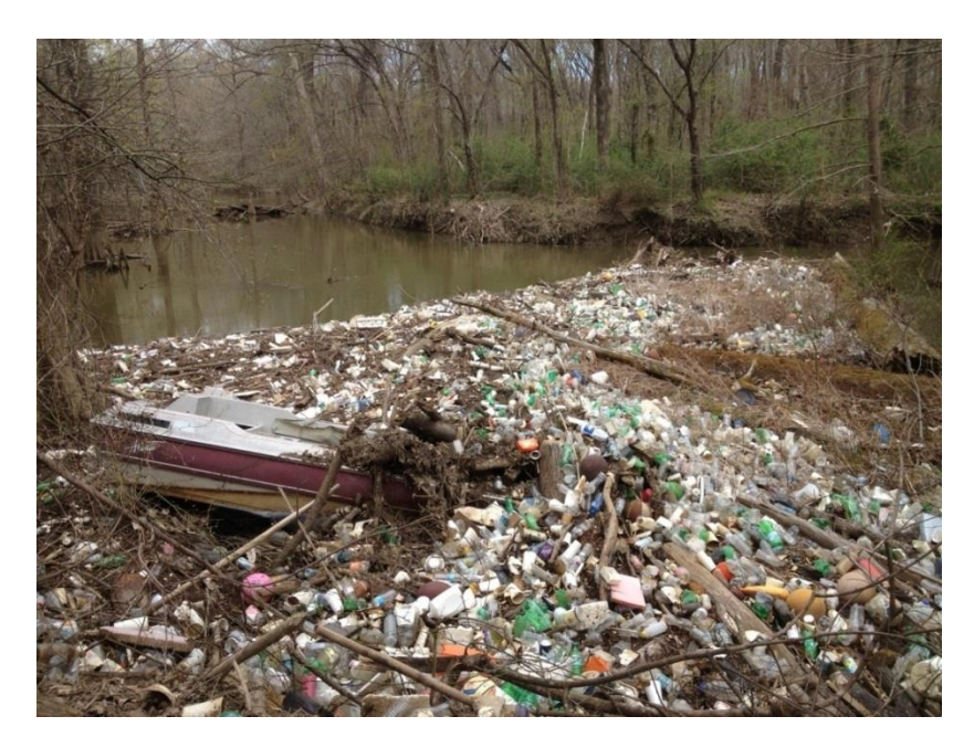
This is where trash tossed down the storm drain and on the street ends up!